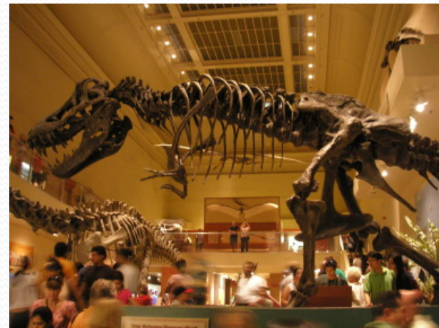
Natural History Museum