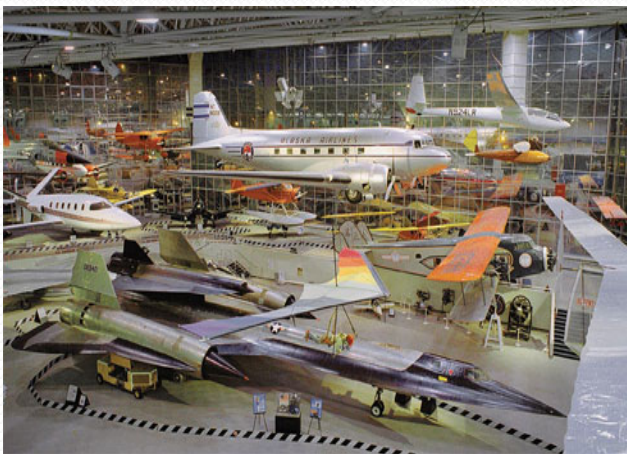
Air & Space Museum