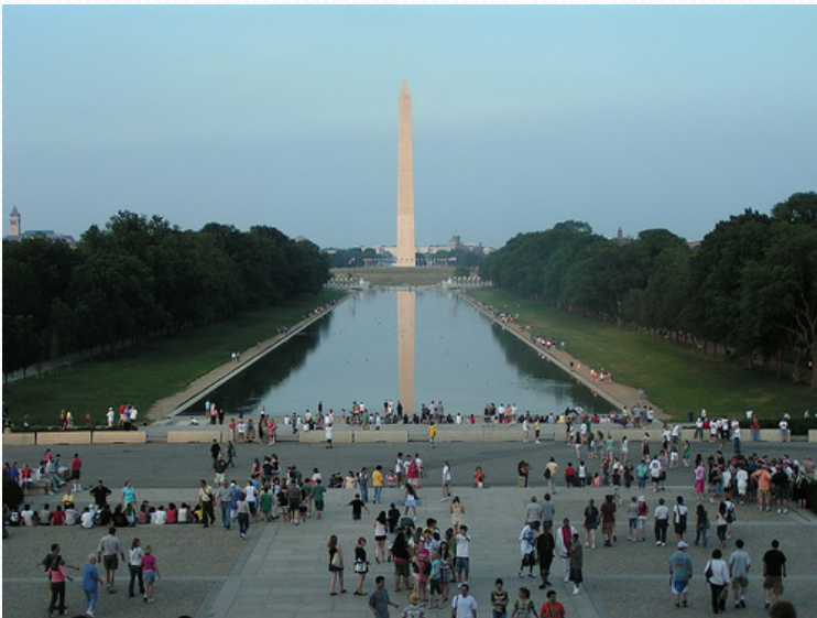
Reflecting Pool and Washington Monument