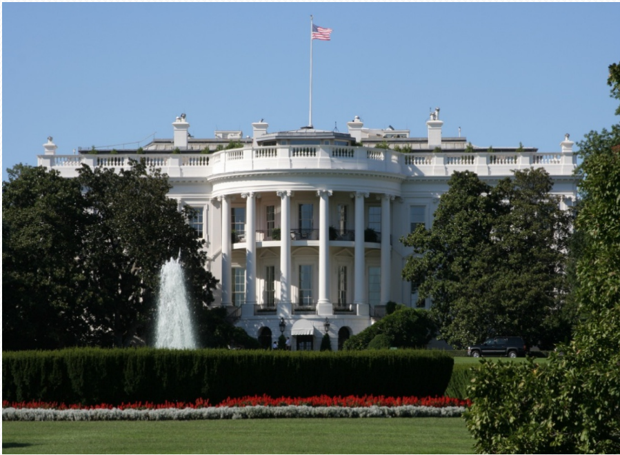
The White House