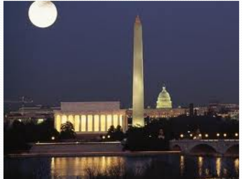
Lincoln Memorial, Washington Monument and The US Capitol @ Night